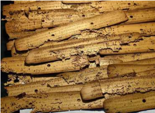
Conservation efforts: The NMM has digitised 3.5 lakh manuscripts that contain 3.5 crore pages. FILE PHOTO

From this year, the NMM has been again put under a Central sector scheme. For Central sector schemes, all initiatives are wholly sponsored and implemented by the Central agencies. The NMM was till now functioning as a part