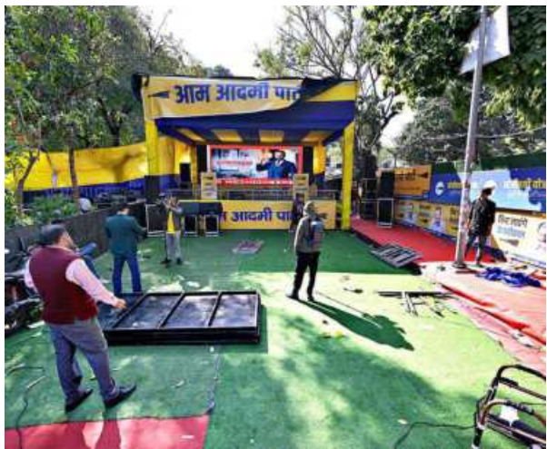
Remains of the day: Workers outside the AAP office at 1, Pandit Ravi Shankar Shukla Lane on Saturday.

As the counting of votes started on Saturday, a few hundred feet from where AAP leaders were expected to stand on stage for victory celebrations outside their headquarters at 1, Pandit Ravi Shankar Shukla Lane, party workers sat excitedly. They began their morning with gusto amid AAP's blue and yellow bunting and a tower of sweets stacked up to be distributed later in the day to celebrate a fourth term in the Delhi Assembly. However, after the first round of counting, the collective change in mood was obvious. “We couldn't believe our eyes and ears as the massive screen displayed live voting trends. From then on, it became a super stressful experience of