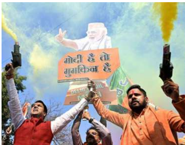
Colours of joy: BJP workers celebrating outside the party office in New Delhi on Saturday.

In what seemed like a freebie versus freebie fight, the BJP seemed to have pulled ahead, which reveals two things – one, that the voter is mindful of the track record of delivery of parties promising freebies. Two, that freebies alone cannot win you an elec-