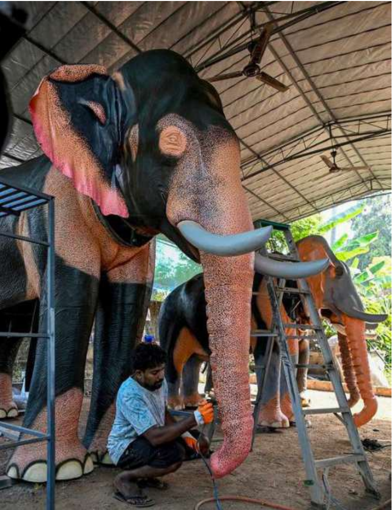
Fine touch: A worker paints the trunk of a mechanical elephant at a workshop in Chalakudy, Thrissur.

elephants for expatriate Malayalis ahead of the Dubai Pooram festival. Since then, they have created over 46 elephants in various sizes, now found across Kerala, several other Indian States, and countries such as the U.S., Canada, Spain, and England. Currently, Prashanth is working on an African elephant model for Kenya. These mechanical elephants, constructed using rubber, fibre, metal, mesh, foam, and steel, are powered by five motors. Powered by electricity, they mimic the natural movements of elephants – shaking their heads, swishing tails, flapping ears, and spraying water. Mounted on wheelbases, they can be easily manoeuvred during processions and rituals via remote control or even manually. The installation of Kombara Kannan made headlines in Kerala, coinciding with reports of three human deaths caused by live elephants on a single day. Recent court interventions have also intensified scrutiny over the use of elephants in festivals. Animal rights activists have long highlighted the suffering of captive elephants used in festivals. Kerala's elephant-related death statistics are alarming: from 2012 to February 2023, wild elephants killed 202 people, while captive elephants caused 196 deaths between 2011 and 2023.