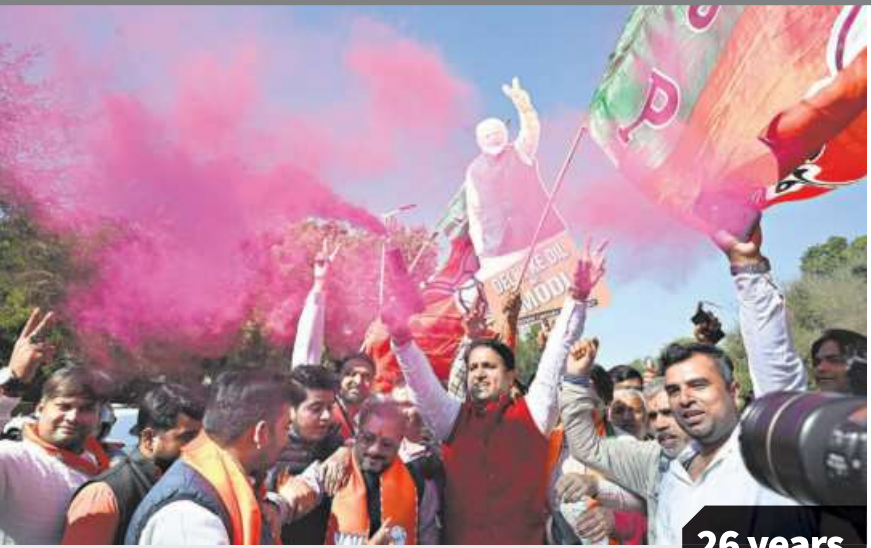
Victory lap: BJP workers celebrate the party's victory in Delhi on Saturday.

Decline in AAP's vote % compared with 2020, in seats with a relatively higher concentration of the city's 'poorest' residents