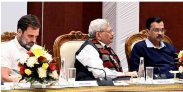
The CPI(M) and the Trinamool worked as emissaries to iron out the difficult relationship between AAP and Congress. FILE PHOTO

In a direct attack on the Congress, senior Samajwadi Party (SP) leader Ramgopal Yadav said the Congress campaigned for the BJP’s victory in Delhi. Communist Party of India general secretary D. Raja said the results were a wake-up call for the constituents of the INDIA bloc, particularly the Congress, the largest party in the coalition, and other dominant regional parties. The poll outcome, he added, “serves as a