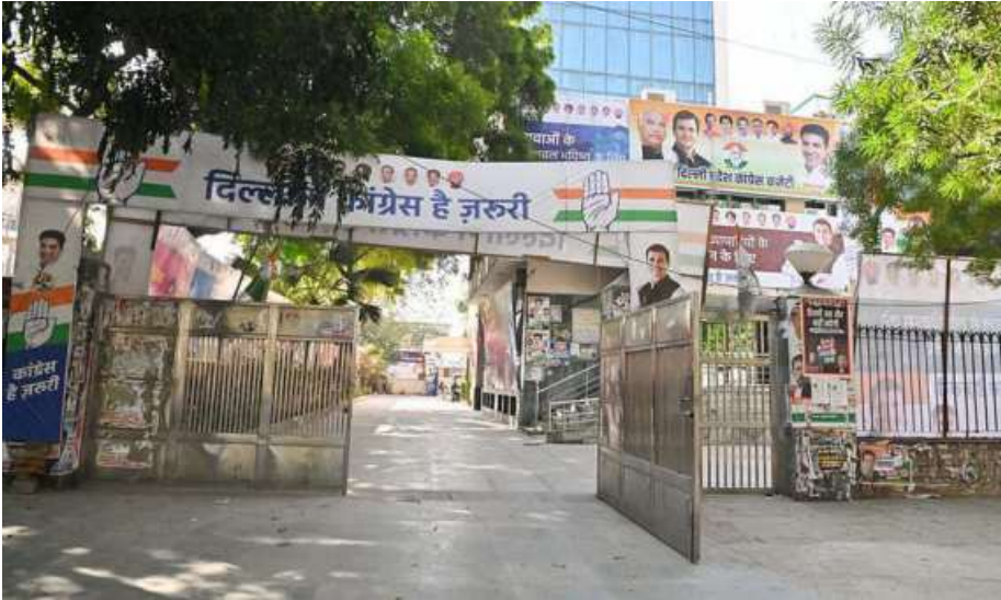
Lost ground: A deserted view of the Delhi Pradesh Congress Committee office during the counting of votes for the Delhi Assembly election on Saturday.

The Congress on Saturday failed to win a single seat in the Delhi Assembly as the party drew a blank for the third consecutive Assembly election in the national capital. The party’s leadership, however, asserted that the Delhi verdict was not a vindication of Prime Minister Narendra Modi’s policies but a referendum on former Delhi Chief Minister Arvind Kejriwal and the Aam Admi Party (AAP). Arguing that the verdict was more about ousting the AAP rather than ushering in the BJP, the Congress’s communications chief, Jairam Ramesh, in a social media post, said the AAP had won decisively in 2015 and 2020, at the height of Mr. Modi’s popularity. “This shows that rather than being vindication of the policies of the Prime Minister, this vote is a rejection of Arvind Kejriwal’s politics of deceit, deception, and vastly exaggerated claims of achievement,”