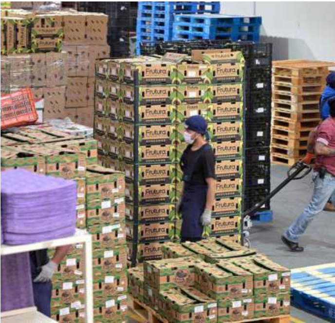
New order: Workers transport boxes of avocados at a packing plant in the municipality of Uruapan, Michoacan state, Mexico, on February 5.

The Trump administration has also said that there is a “growing presence of Mexican cartels operating fentanyl and nitazene synthesis labs in