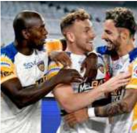
Chennaiyin players celebrate.