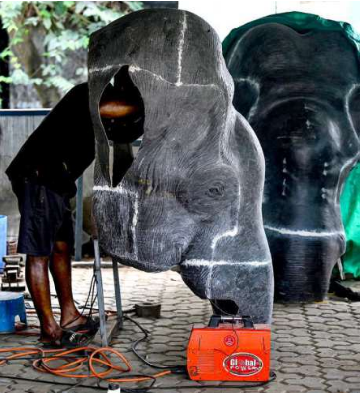
Crowning glory: A worker puts together material that will go on to become the head section of a mechanical elephant structure.