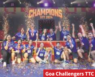
Goa Challengers TTC

Voting lines open for 2025 Sportstar Aces Awards. Scan the QR code