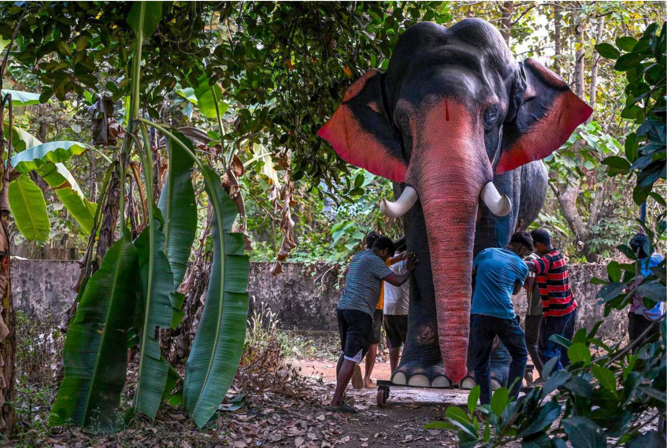
Majestic creation: The completed mechanical elephant being moved from a workshop before being offered to the Kombara Sreekrishna Swami Temple in Thrissur district.