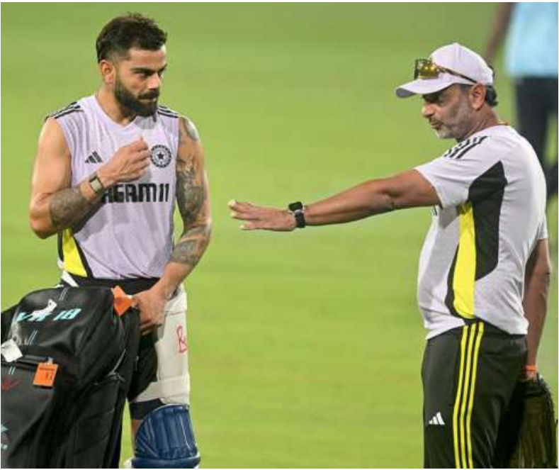
Testing times: Kohli and Rohit will be eager to come good and silence the critics.

Kohli, who also went through a lean phase in red-ball competitions, looked fit to take the field. It will be interesting to see whom he replaces, especially after Shreyas Iyer’s excellent performance in the first ODI. India urgently needs to decide its pace combination for the ICC event. As Jasprit Bumrah’s return is still in doubt and Mohammed Shami’s