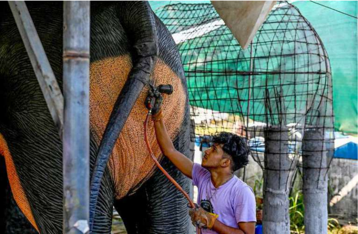
Right texture: Finishing touches are applied to the tail of a mechanical elephant next to a metal and cement framework.