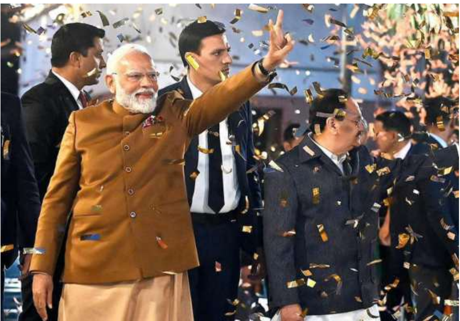
Triumphant win: Prime Minister Narendra Modi waving to supporters as he arrives to celebrate the BJP’s victory in the Delhi Assembly elections on Saturday.

ring to the AAP government as an ‘AAPda’ (disaster in Hindi) at his rallies. “Now Delhi’s double-engine government will ensure development at double speed. It is a historic win and not a usual victory as the people of Delhi have shown the door to ‘AAPda’,” he said.