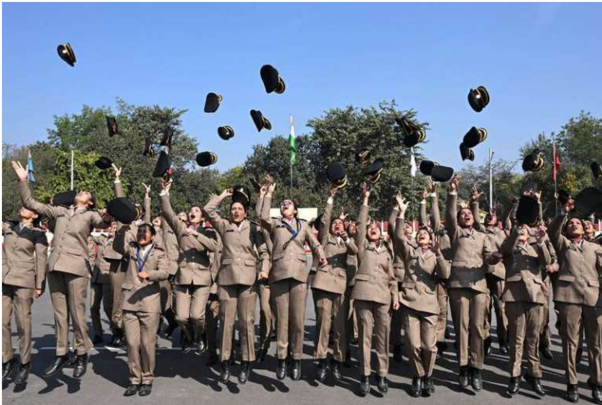
Into the ranks: Students of the College of Nursing, Command Hospital, Central Command, celebrate after their commissioning ceremony in Lucknow on Saturday.