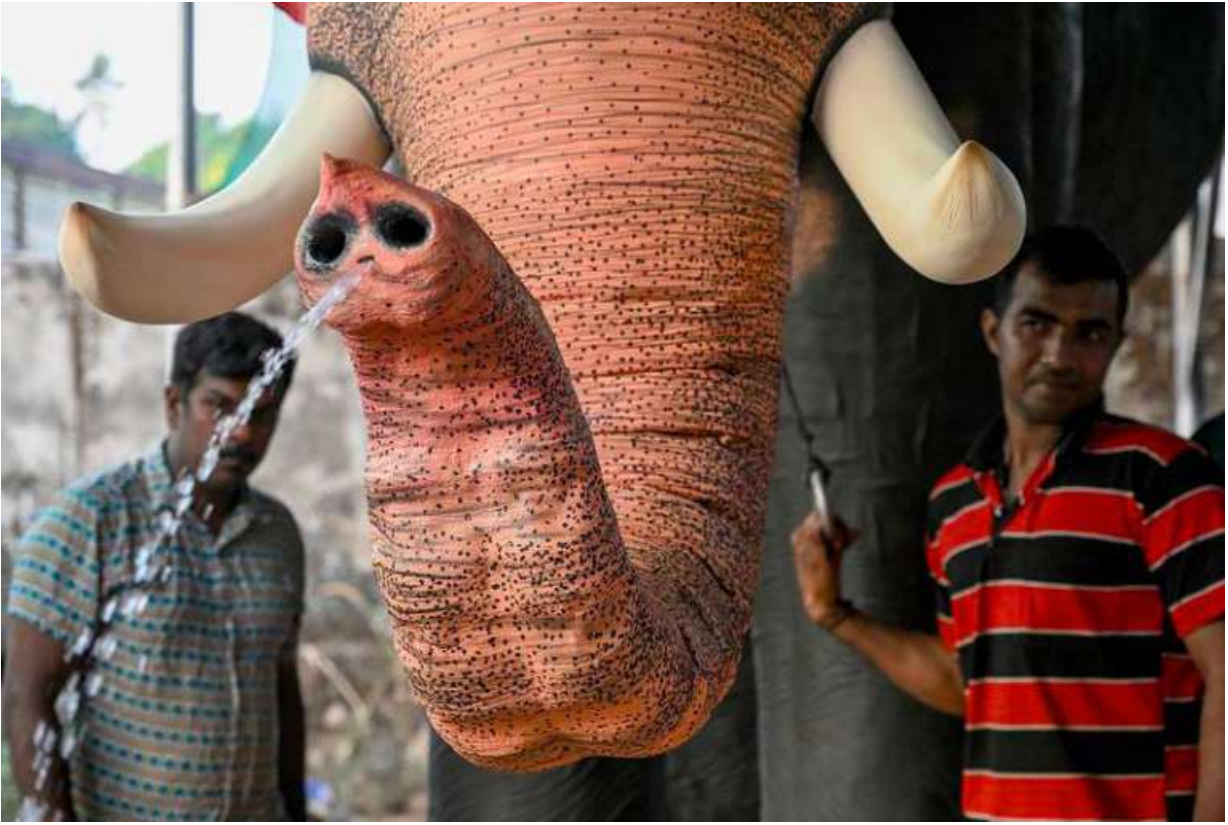
Art imitating life: The water spraying mechanism from a mechanical elephant's trunk gets a test run.