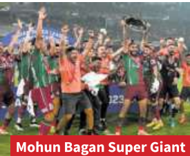
Mohun Bagan Super Giant