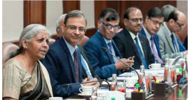
Finance Minister Nirmala Sitharaman and RBI Governor Sanjay Malhotra and Directors at a meeting in New Delhi on Saturday.

The government expected India's tepid private investment trends to reverse, Ms. Sitharaman indicated, citing anecdotal inputs from industry lead-