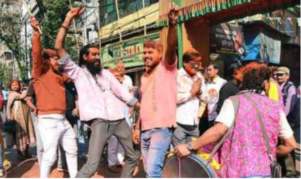
Upbeat mood: BJP supporters breaking into a jig after the Delhi Assembly poll results were declared, in Kolkata on Saturday.

NAAC said it is planning to take additional steps to refine the system by eliminating the scope for unfair practices in the system.