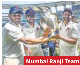
Mumbai Ranji Team