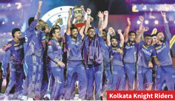
Kolkata Knight Riders

2024 was a landmark year for Indian sports with a host of achievements across several disciplines. The annual Sportstar Aces Awards seek to honour the trailblazers