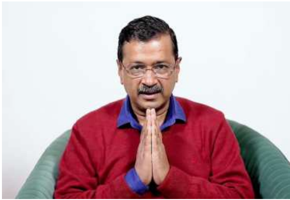
AAP chief Arvind Kejriwal making a video statement on Saturday.

As the dust settles after the election and the Aam Aadmi Party (AAP) is left smarting from the results, the one question its rank and file will be left with would be – between losing power in Delhi and party chief Arvind Kejriwal's defeat from New Delhi seat, what hurt more? For AAP, which has fought elections in other States, including Punjab in 2022, on its chief's “clean” image and the ‘Delhi model’ of governance, it will be hard to recover from the twin losses. However, Mr. Kejriwal may have an even bigger problem at hand. The AAP national convener, who was arrested and jailed in