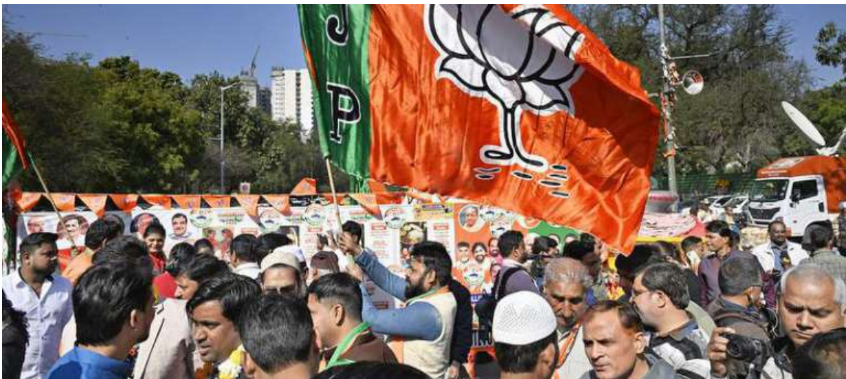
Moment of glory: BJP workers celebrating outside the party's office in New Delhi on Saturday.

It was not just the anti-incumbency but consistently cornering the Aam Aadmi Party (AAP) over corruption charges, civic issues and infrastructure, micromanaging the election campaign through hundreds of grassroots meetings, and targeting women, Purvanchali and JJ cluster vote banks through poll promises that led the BJP to break its 28-year-old jinx in the Capital and trounce AAP by bagging a whopping 48 of 70 seats. Learning from its mistake of targeting AAP over free electricity, power, and bus tickets, which it had termed “free ki revdi” (freebies), the BJP changed its strategy, a party leader said. In its manifesto, it too promised several schemes, including direct cash transfer to women. Along with the traditional methods of campaigning, local party leaders focused on micromanagement and held over 5,000 meetings. However, a key message