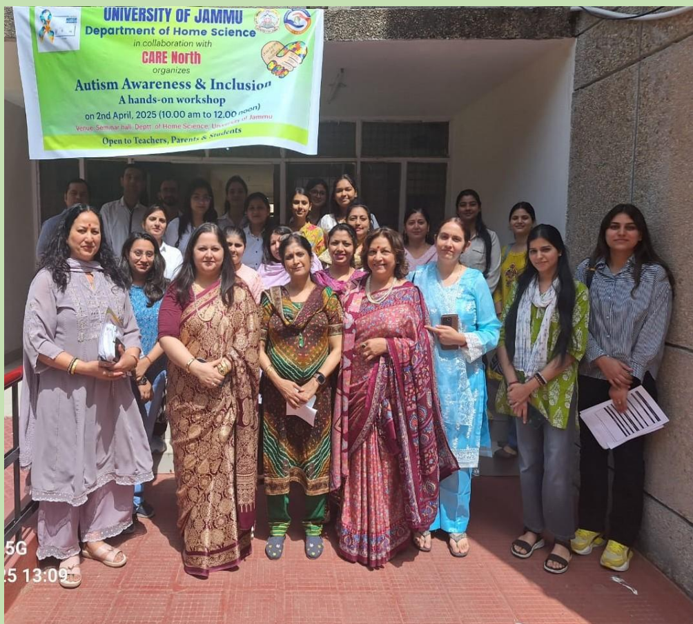
Participants of Autism Awareness and Inclusion Workshop