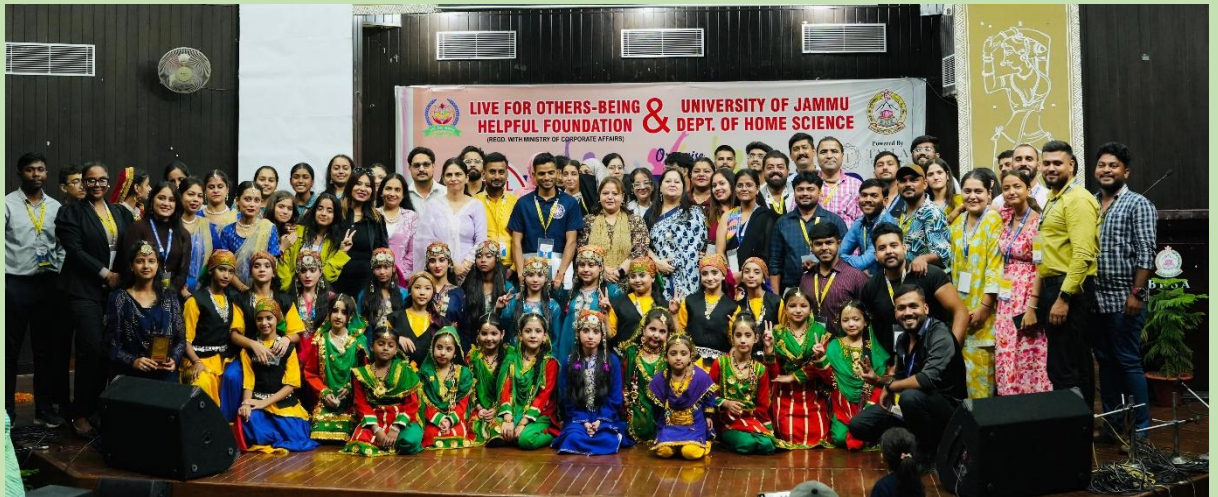
Participants of the National Youth Exchange Program

while a cultural evening showcased India's diversity. The valedictory event included the National Youth Excellence Award Ceremony, honoring achievers from 15 states and Union Territories for outstanding contributions in social work, literature, culture, and art, recognizing exemplary youth leadership and service.