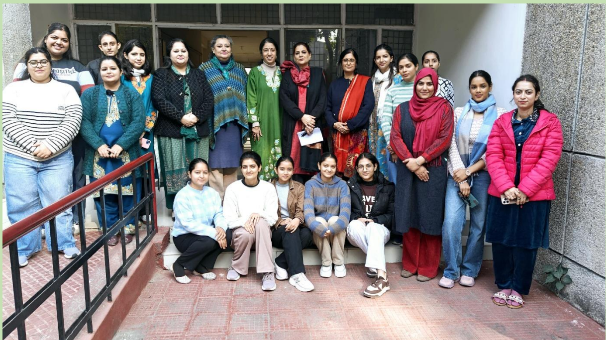
Lecture on Contemporary Discourses in Home Science Research and Pedagogy organized