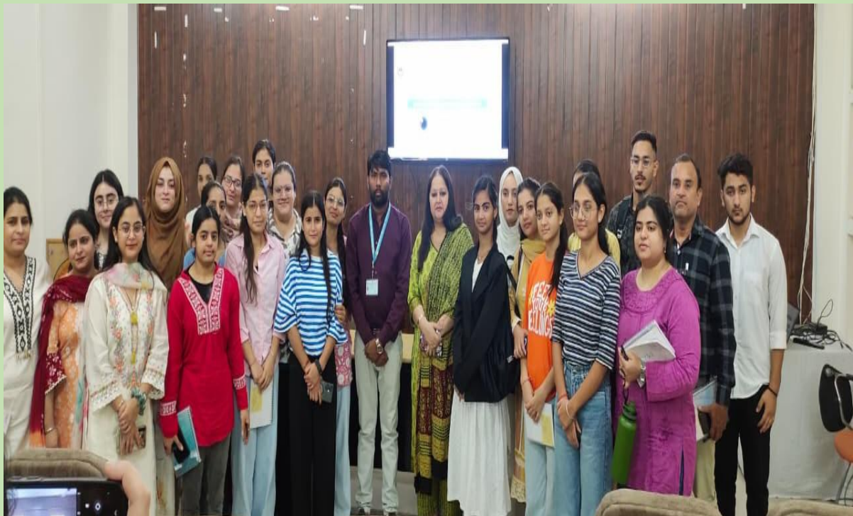
Participants of World Sight Day celebration at JU