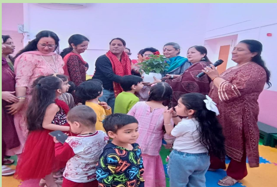
Children of SNS enjoying musical event