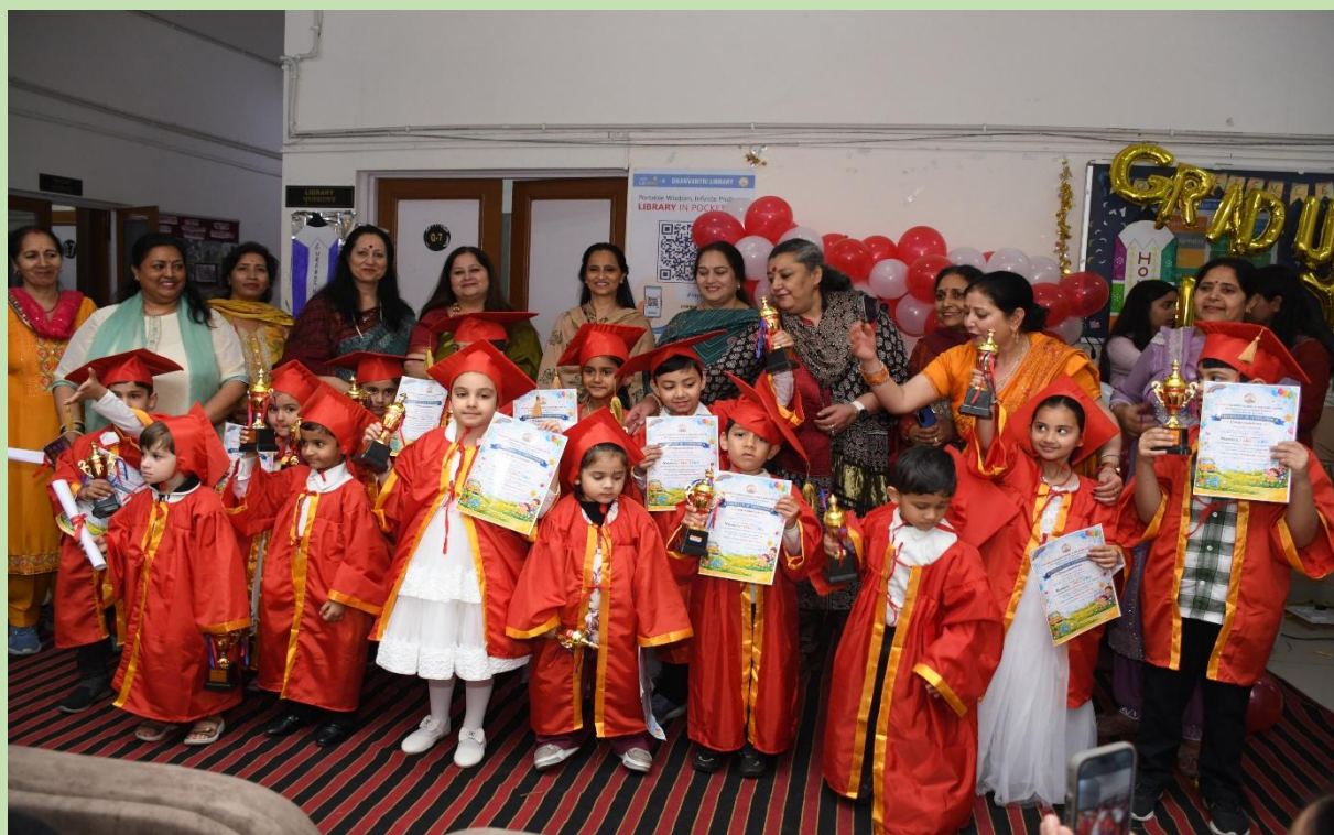
Children of SNS graduating from the Nursery School