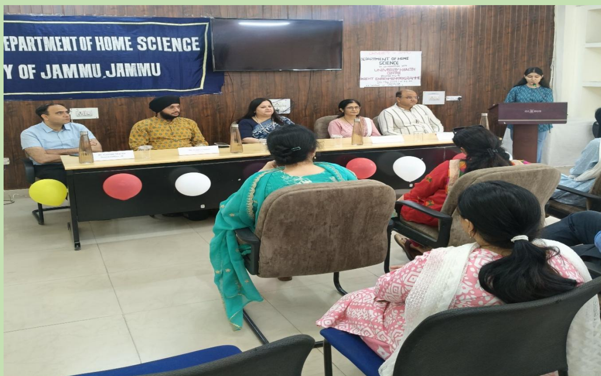
Resource persons of parenting workshop