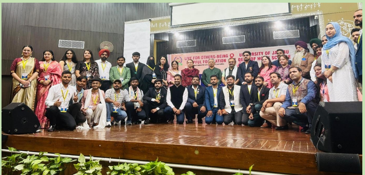
Valedictory function of the National Youth Exchange program

11. Interactive Parenting Workshop on "Parenting for a Healthier Today and Tomorrow": The Department of Home Science, University of Jammu, on 5 th May 2025 organized an interactive Parent Empowerment Program titled “Parenting for a Healthier Today and Tomorrow” for the parents of children enrolled at Surabhi Nursery School and Day Care