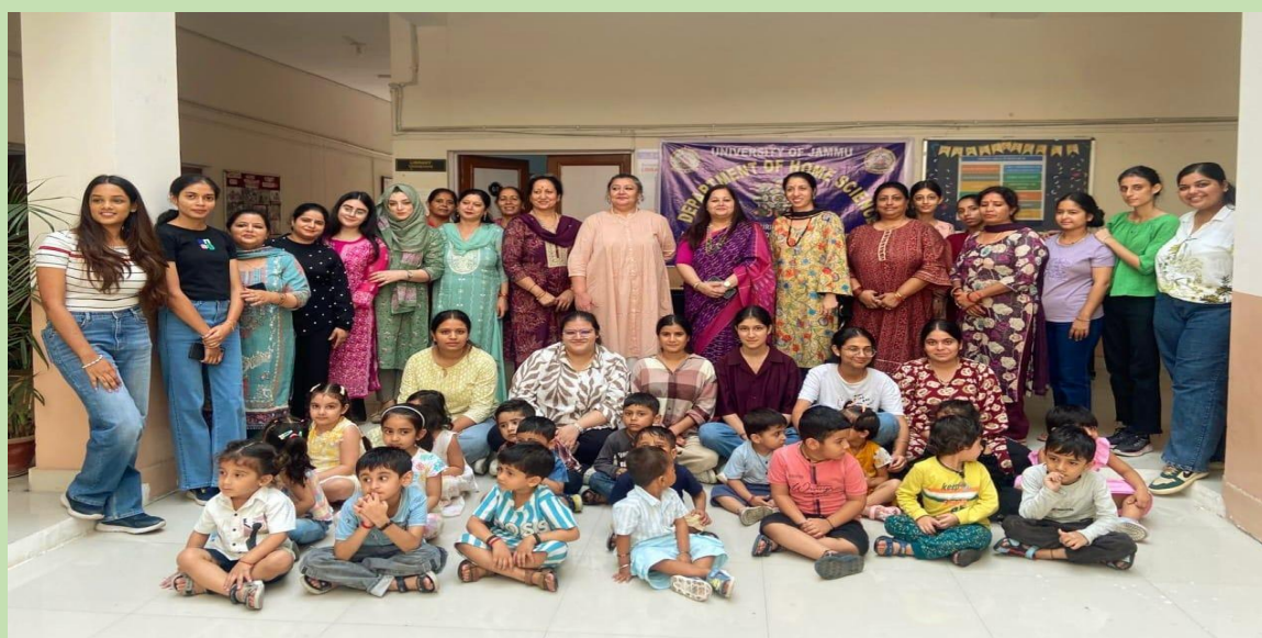
Maternal and Child health training program