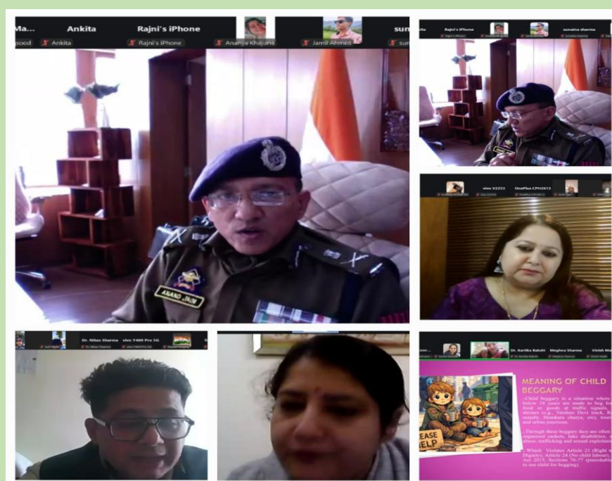
Resource persons interacting with the participants of the capacity building workshop

4. Capacity-building workshops on “Convergence Approaches towards Beggary Elimination” : P.G Department of Home Science (Human Development), University of Jammu, in collaboration with the National Institute of Social Defence (NISD), Ministry of Social Justice and Empowerment, Government of India, successfully organized two online capacity-building workshops on “Convergence Approaches towards Beggary Elimination” (13–14 and 21–22 February 2026). The workshops addressed beggary as a multidimensional human development and human rights issue, emphasizing policy frameworks such as the SMILE Scheme, institutional convergence, and rehabilitation strategies.