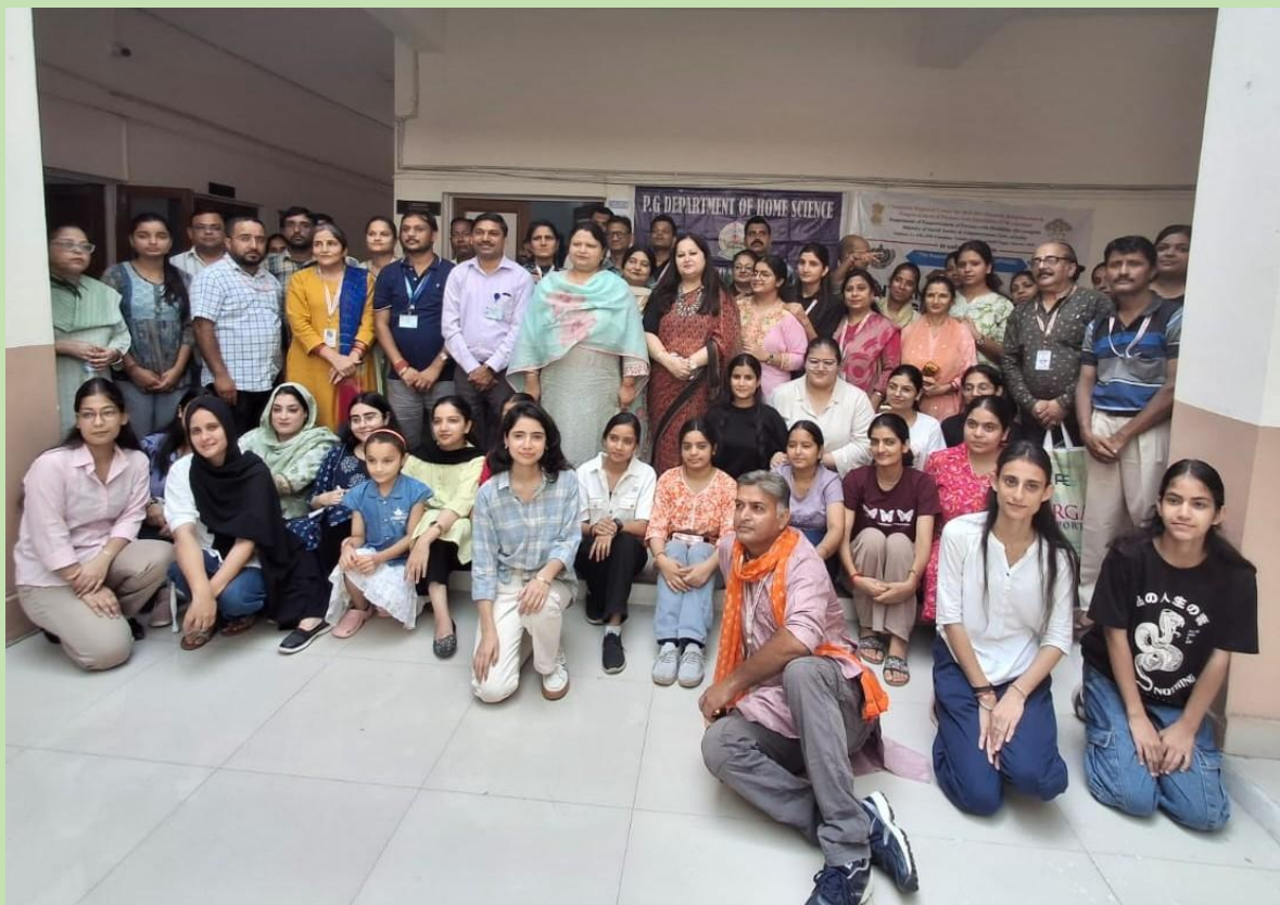
Participants and dignitaries emphasizing importance of Sign Language