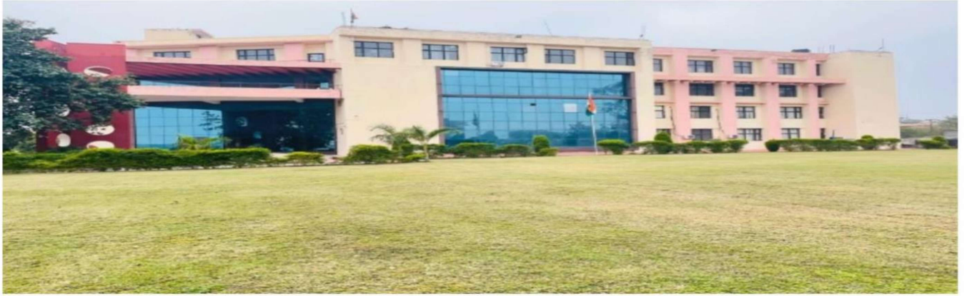
Kathua Campus, University of Jammu