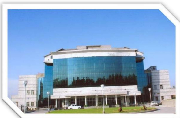
General Zorawar Singh Auditorium