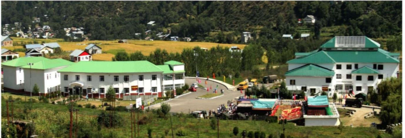
Bhaderwah Campus, University of Jammu