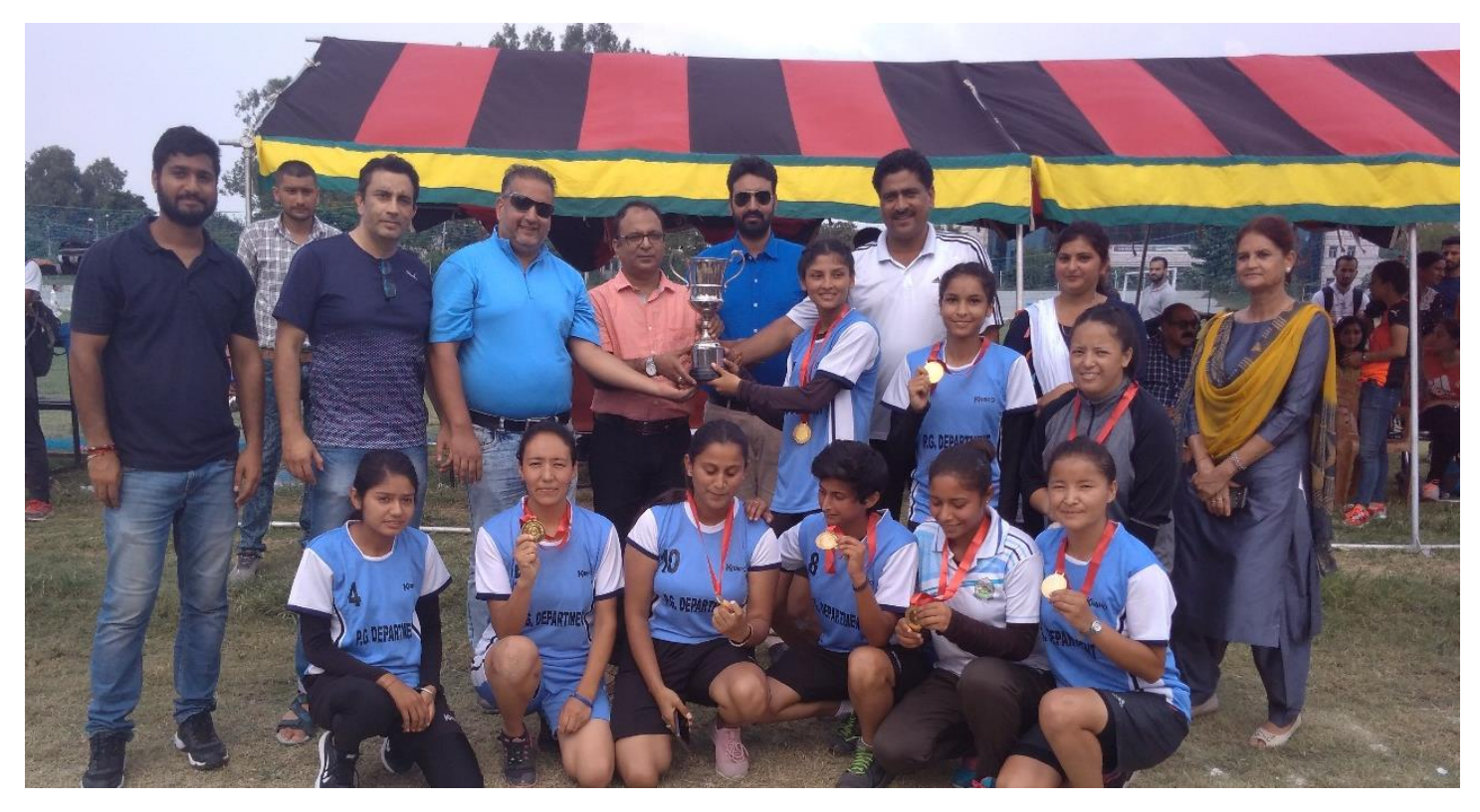
Inter Collegiate Handball (M&W) Tournament 2019-20

The combined side of P.G. Department claimed Handball Men and Women titles and lift both the trophies in the ongoing Inter Collegiate Handball (men & Women) Tournament 2019-20 organized by the Directorate of Sports & Physical Education, University of Jammu at University Handball Court.