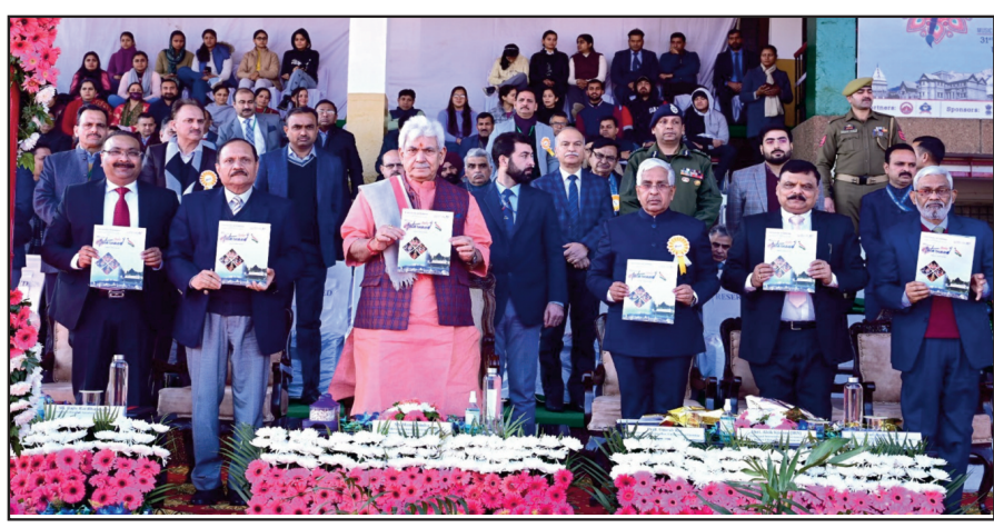
Lieutenant Governor, J&K and Vice-Chancellor, JU, along with other dignitaries during the inaugural of Antarnaad Youth Festival at JU