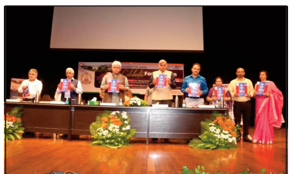
Dignitaries during the 53rd Jammu

Invoking the vision of Shri Narendra Modi, the would redefine education pressed his full support Governor also said that opening the mind of the and independent thinking student is provided with confined to the classnurture creativity and